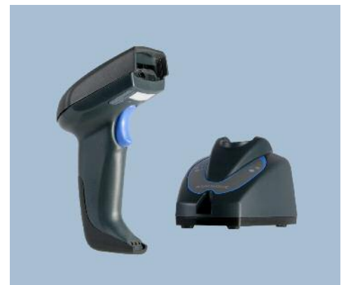
QuickScan Mobile Reader and Cradle